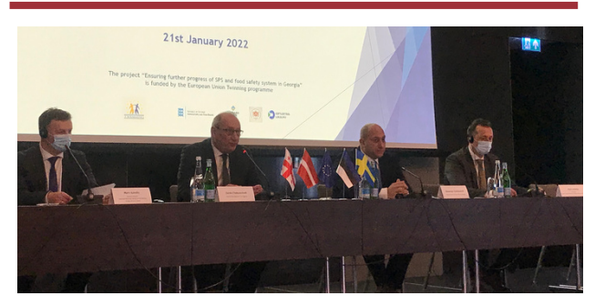
On January 21, 2022 in Tbilisi, Georgia project held a dedicated high level event to take stock of its progress in helping Georgia to bring its sanitary, phytosanitary and food safety system closer to EU standards and practices. This review is overview of activities performed and results achieved in one year period.

Implementation period: 02.11.2020.-1.05.2023.